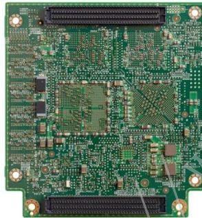
ESS 3300 Mainboard